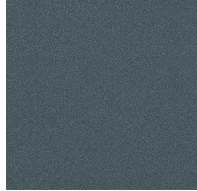
Twilight - 14 (TWT)