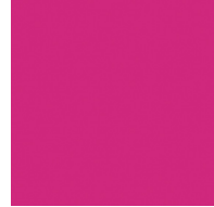
Funky P. - 18 (FUP)