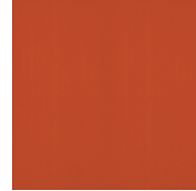
Fresh Oh - 17 (FRO)